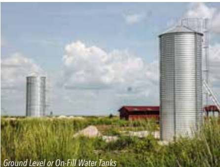
Ground Level or On-Fill Water Tanks