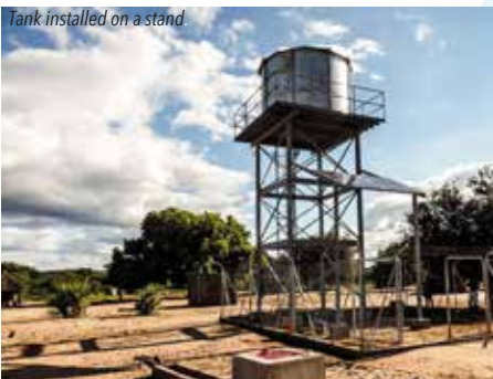
Tank installed on a stand