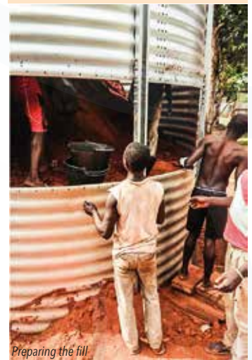
Preparing the fill