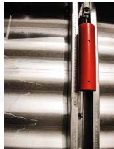
Level indicator on the outer tank wall.

* Numbering rule: 302 for 3 sheets per ferrule and 2 ferrules, 705 for 7 sheets per ferrule and 5 ferrules, etc.